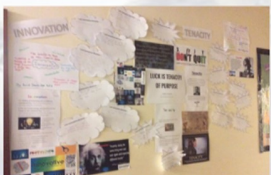
11ANH and 7IMA